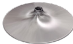
Brushed Nickel Trumpet*