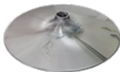
Polished Chrome Trumpet*