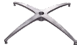
Brushed Silver X-Base

*Weighted trumpet base option also available in a package that includes a larger transport cart than pictured above. Please call for details.