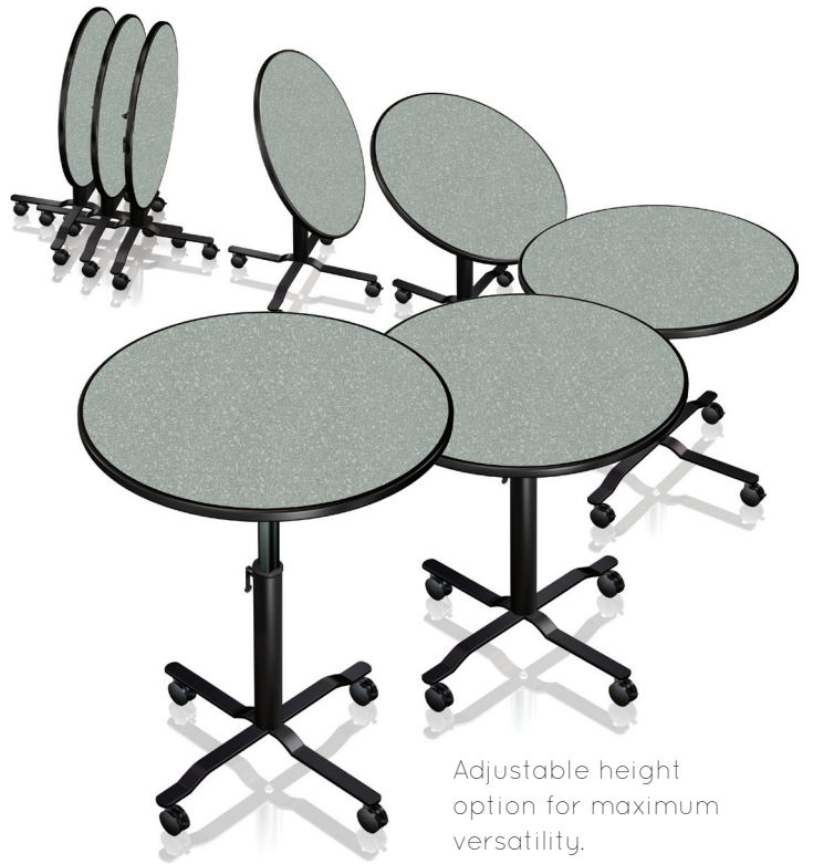
Adjustable height option for maximum versatility.

Rollers™ can be easily moved for different layouts, set to different heights and nested for storage, all with stunning convenience. And all Rollers™ portable tables feature MAXX Edge® for amazing, seamless durability.