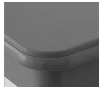
Grey, molded, ABS top with matching edge

Resilient® Lightweight ABS Plastic Tables