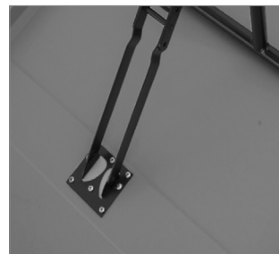
Spring-loaded, leg-brace locking mechanism.