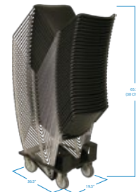
Transport System HD-SSD