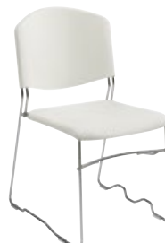
PC500 with Integral Frame Ganging