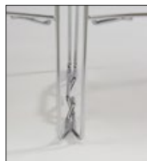
Integral Frame Ganging