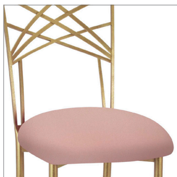
CUSHION CAP COVERS (goes over White Poplin Cushion - Stretch Knit Blush Pictured)