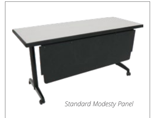
Standard Modesty Panel

Extended Modesty Panels extend to the full length of the tables for greater protection.