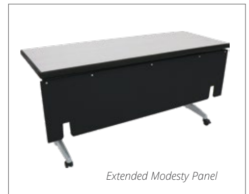
Extended Modesty Panel

Revolution Shield™ Flip-Top Tables with Amulet® Ballistic Barriers