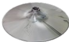
Polished Chrome Trumpet*