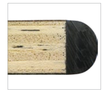
Plywood core bonded edge means no gap between the edge and the table.