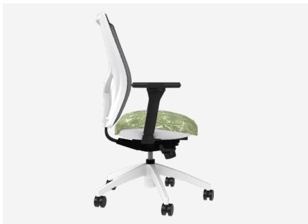
Signature Series™ Seating