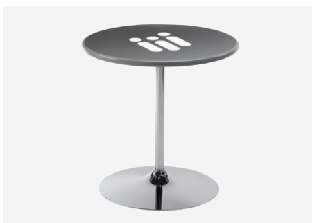
Revolution® Custom Logo Tables