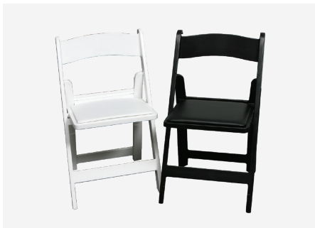
Classic Event Chairs (C440/C450)