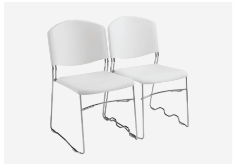
PremierComfort® Sled Stacking Chairs (PC500/501)