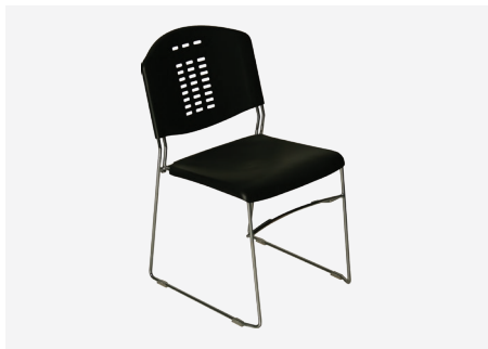
PremierComfort® Sled Stacking Chairs (PC500/501)