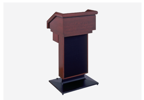
Solid Hardwood Lecterns (Executive Model)