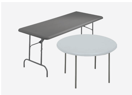
Resilient® Premium Plastic Tables