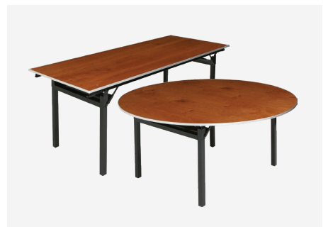
600 Series Plywood Banquet Tables