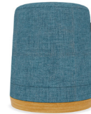
Mid - Flat