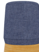
Tall - Flat