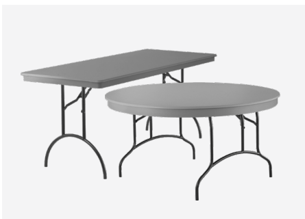
Resilient® Lightweight ABS Plastic Tables