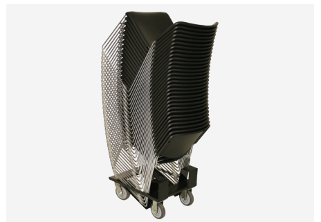
Sled Stacking Chair Dolly (Model HD-SSD)