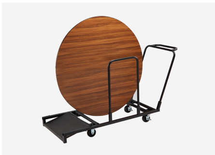
Table Transport Carts (Model DX-RTC)