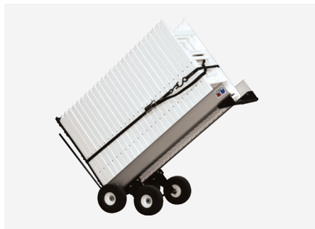
Folding Chair Transport Carts (Model HD-ATC)