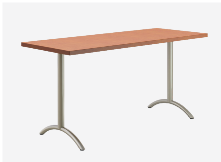
Acacia Collection™ Tables