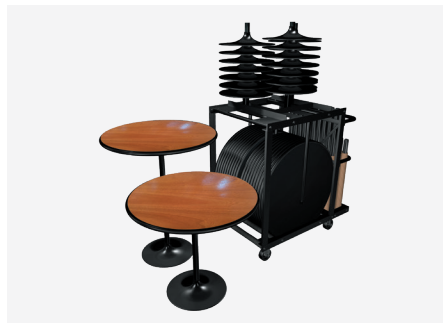
MAXX-IC™ Reception Tables & Packages