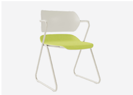
The Acton Seating Line