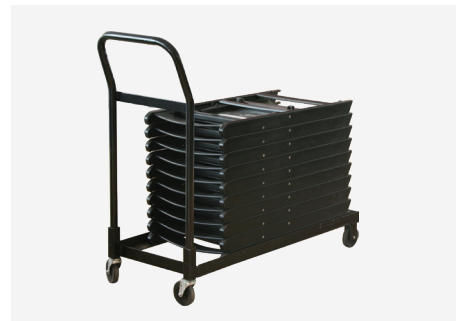
Chair Transport Carts (Model PCC-100)