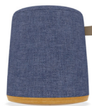
Short - Rock