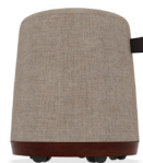
Short - Roll