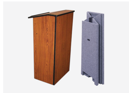
Portable Folding Lecterns (Model PFL & New Dimensions)