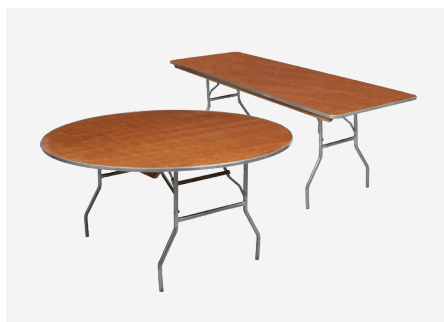
Plywood Tables (Model 200 Series)