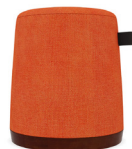
Short - Flat