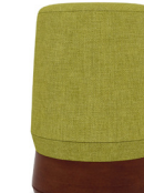
Tall - Roll

Our award-winning MÜM™ (pronounced Moom) is a collection of seating designed to enable movement while seated, while also being lightweight and very easy to relocate. MÜM™ are offered in three different base height options – Short, Mid & Tall – and three different base style options – Flat (stationary), Rock (rocks back & forth) & Roll (mobile casters). Choose the combination that works for you!