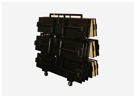
Revolution® Table Cart (Model REV-TTT)