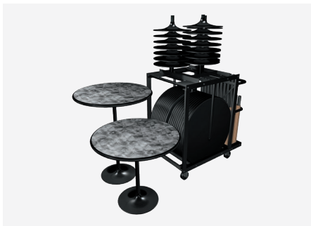
Revolution® Café Tables & Packages