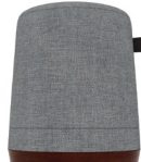
Mid - Roll