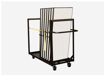
Revolution® Table Cart (Model REV-VTT)