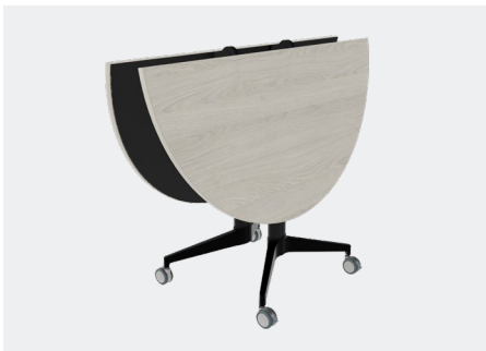
Scissor™ Vertical Fold-In-Half Rolling Tables