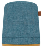
Mid - Rock