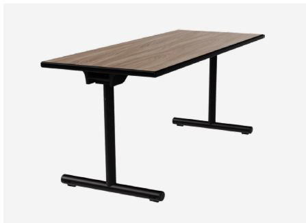
Revolution® Folding Tables