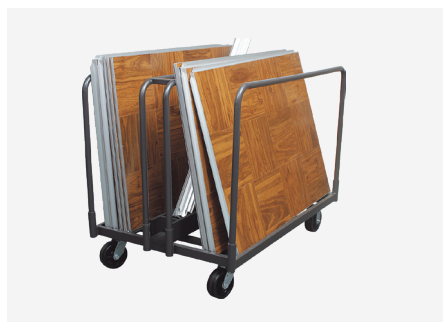
Dance Floor Transport Carts (Model HD-DFC)