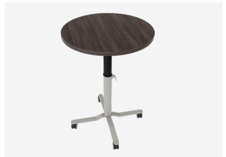
Rollers™ Mobile Tables