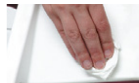
EFFORTLESS maintenance as Classic Event chairs clean easily.