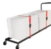
DOUBLE STACK PCC-200