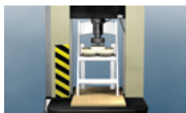
THOROUGHLY TESTED by an independent lab and passed with a 300lb dynamic and 2000lb static load capacity.