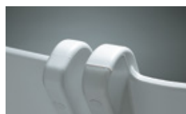
STREAMLINED 2-part molding avoids unsightly seams.