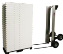
ALL-TERRAIN CHAIR DOLLY HD-ATC

CAPACITY 25 Chairs DIMENSIONS 36"L x 19"W x 58"H