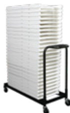
SINGLE STACK PCC-100