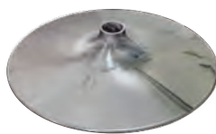
Polished Chrome Trumpet*