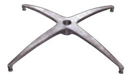
Brushed Silver X-Base

* Weighted trumpet base option also available.