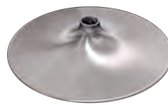
Brushed Nickel Trumpet*