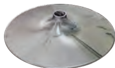
Polished Chrome Trumpet*